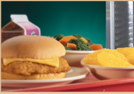
Ideal For Use On The Tray Line