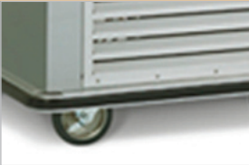
6" Heavy Duty Casters w/Stress Pads & Full Perimeter Bumper Protects Cabinet From Damage

Well known for providing application equipment, Traulsen's Air Curtain Refrigerators are no exception. Ideal for use along a tray line, these high quality units keep food safe and cold for ninety minutes or more with the door left open. They also include a number of features intended to make them mobile since they are rarely loaded and unloaded in the same place.