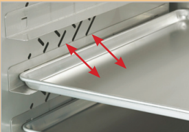
Superior 3D Airflow Screen Pattern Keeps Food Cold With The Door Open