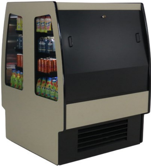
FSC463R with removable solid security covers

Double your selling space without doubling your footprint!