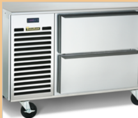
Optional Drawers In Lieu Of Door, Accommodates 6" Deep Pans