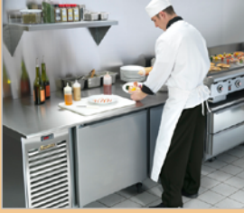
Offers Easy, Convenient Chilling For Any Size Or Type Of Kitchen