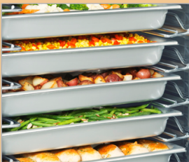
Optional Five (5) Level Universal Type Tray Slides

These days you can't underestimate the importance of food safety. You have a real need to chill food rapidly, either to save labor through increased productivity, or to increase your sales by selling cold to-go items like rotisserie chicken. Doing so in a standard reach-in or walk-in just doesn't cut it anymore, and traditional blast chillers are way too expensive and complicated for your operation.