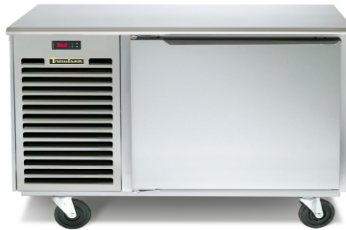
Model TU048QC (shown with optional casters, top & left hinging)

Our new Undercounter Quick Chiller offers performance comparable to more expensive blast chillers, but without all the control and documentation features. Your food will be rapidly chilled automatically. All you need to do is monitor food times and temps manually, just as you're probably already doing. Simple, cost-effective chiller that gets the job done. That's Traulsen. Trusted.