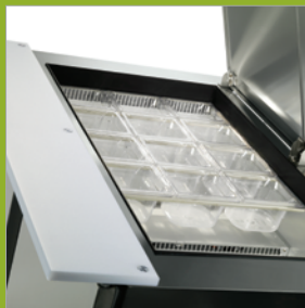
Insulated Pan Lids, Rugged Pan Ledge, & Reversible Cutting Board