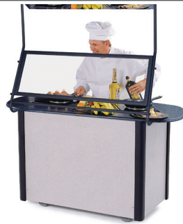
Shown with optional Food Shield and Demonstration Mirror