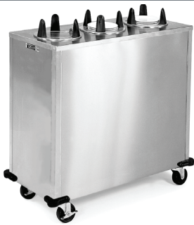
Shown with optional Food Shield and Demonstration Mirror