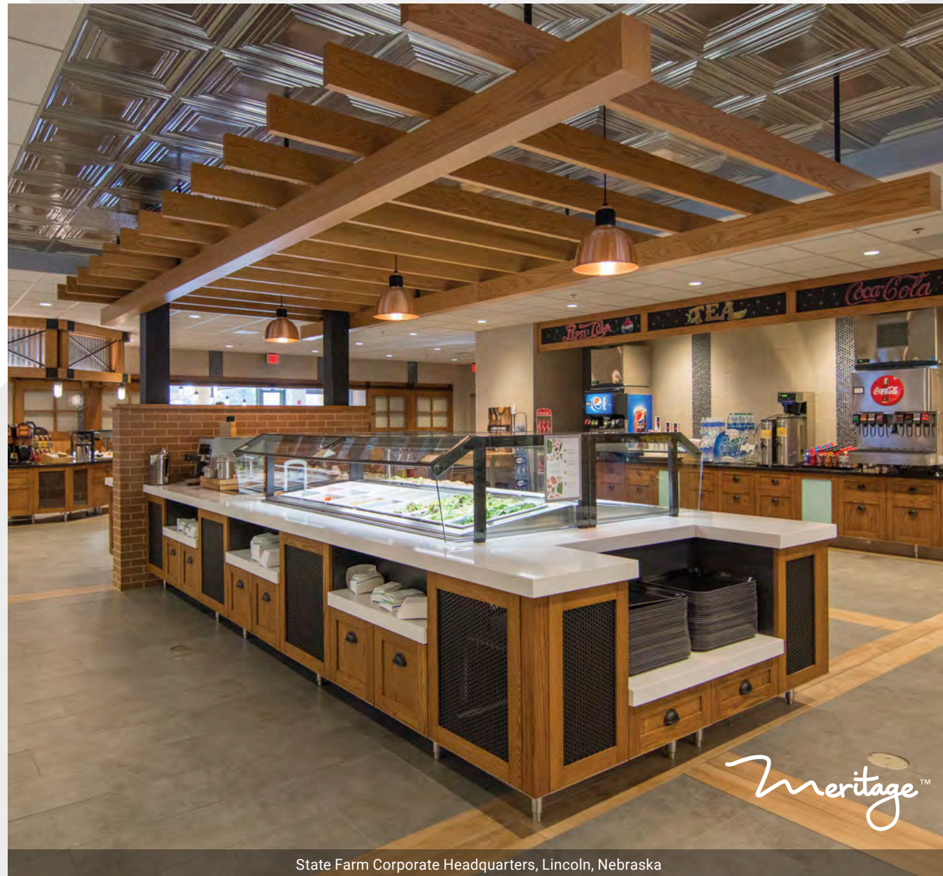
State Farm Corporate Headquarters, Lincoln, Nebraska

Pam needed the serving lines quickly, so Multiteria's fast sales response and delivery saved the day.