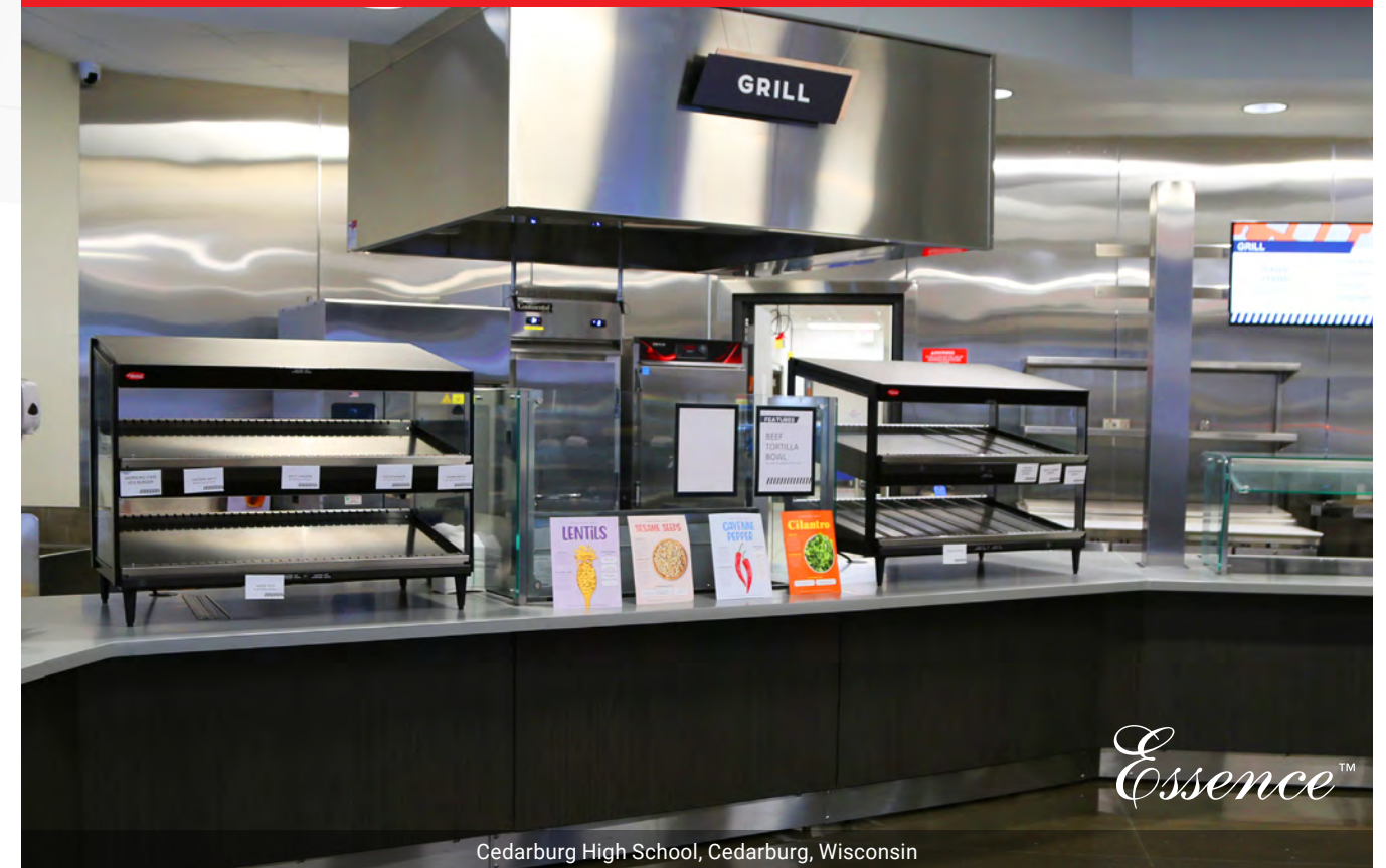
Cedarburg High School, Cedarburg, Wisconsin