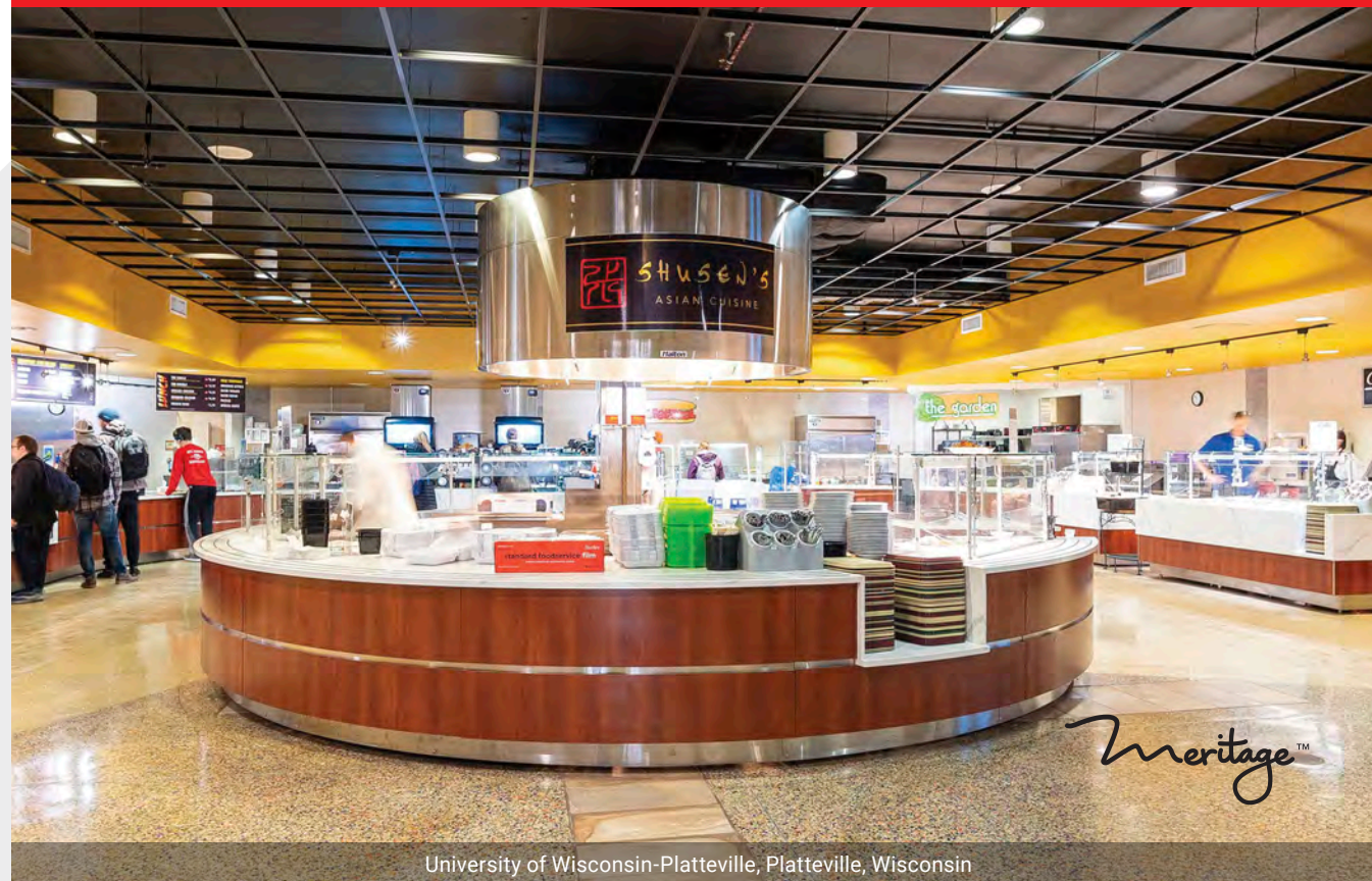
University of Wisconsin-Platteville, Platteville, Wisconsin