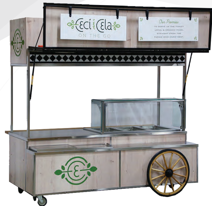
Facebook, Hudson Hall Commons, New York. Three independent food cart designs emulate New York City's iconic food carts.