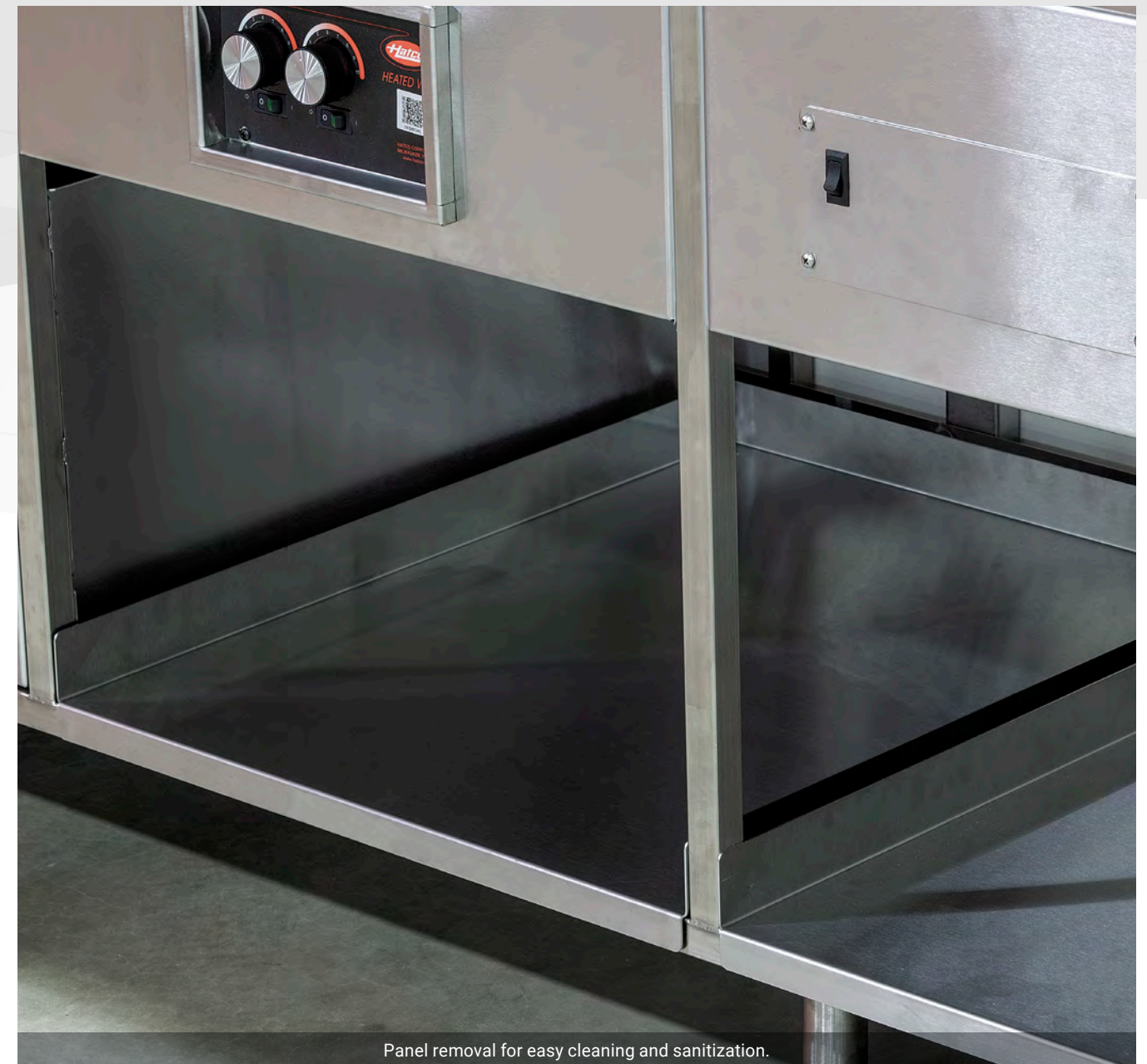
Panel removal for easy cleaning and sanitization.

hazards—saving you from potential injury costs from accidents. Designs that are made with operators in mind, blending functionality with necessity. Removable front panels also allow for easy remodel to change design themes without disrupting the lifetime frame.