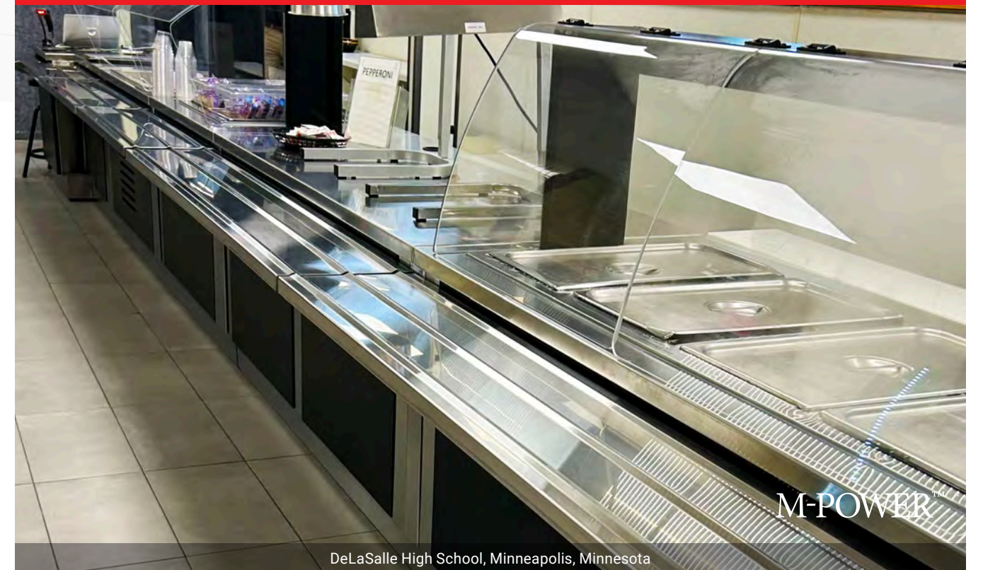
DeLaSalle High School, Minneapolis, Minnesota