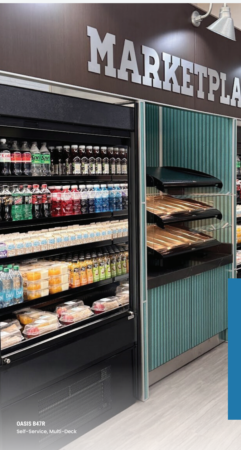
OASIS B47R Self-Service, Multi-Deck