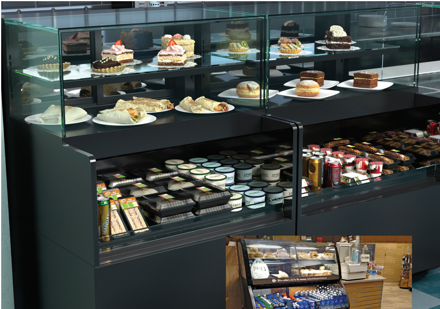
REVEAL NR3651RRSSV Combination

Structural Concepts can adjust to keeping up with the everchanging trends in school foodservice.