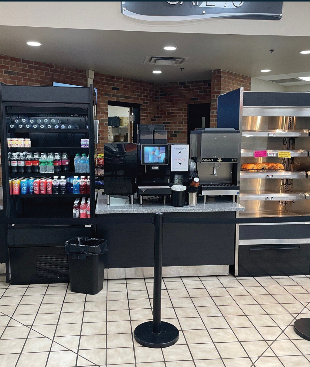
OASIS B37R, B3632H Self-Service, Multi-Deck