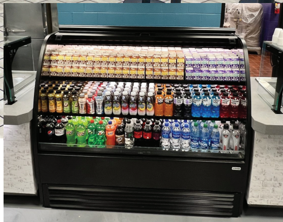
HARMONY 3953R Self-Service, Multi-Deck

Multi-Deck Enhance Convenience and Speed of Service to Time-Starved Shoppers Stimulate sales by offering a variety of grab & go options with self-service cases to accommodate modern consumer's fast-paced lifestyle and desire to make speedy selections and transactions.