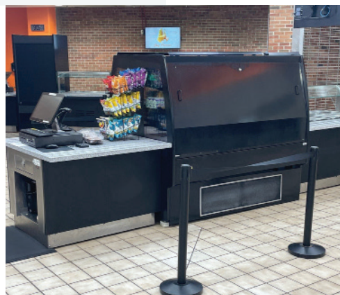
OASIS FSC660R Self-Service, Island