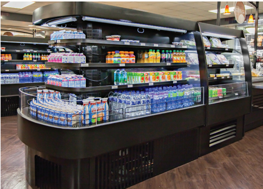
OASIS FSE660R Self-Service, End Cap