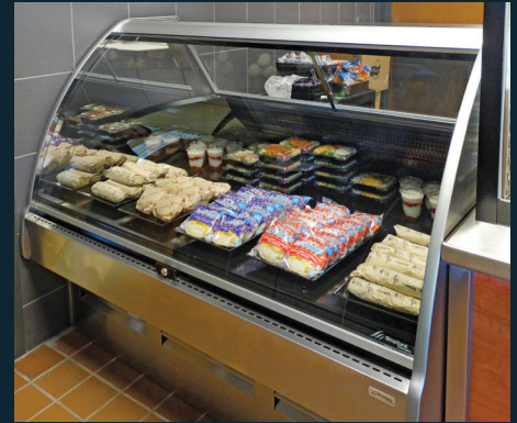
FUSION GLDS6R Service, Single-Deck

We can help meet the demand for healthier options and better-for-you foods with temperature-controlled merchandisers that perform at the highest levels.