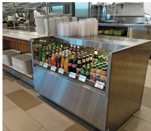
OASIS C43R-CH Self-Service, Single Deck