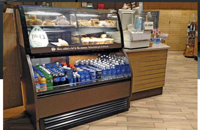
HARMONY HMBC4 Combination