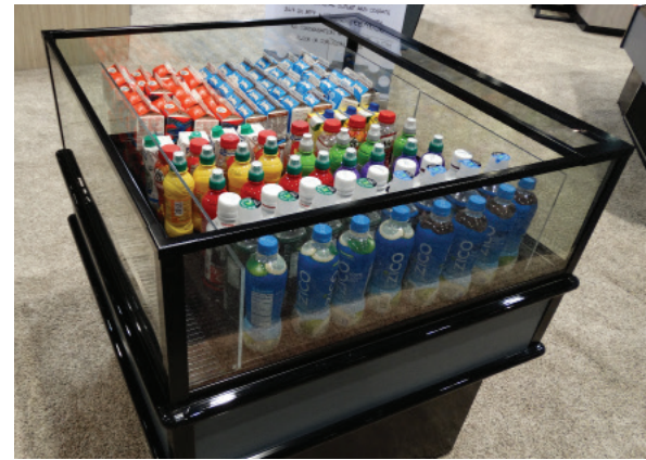
OASIS MI33R Self-Service, Island